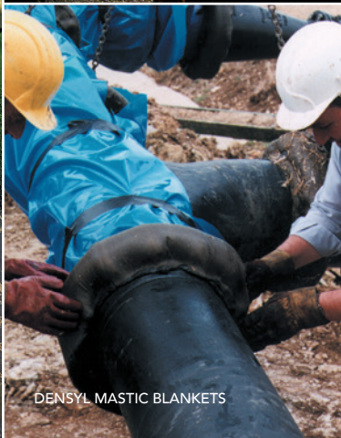
DENSYL MASTIC BLANKETS