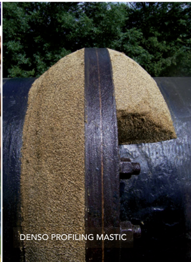
DENSO PROFILING MASTIC