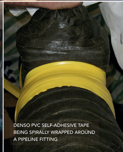
DENSO PVC SELF-ADHESIVE TAPE BEING SPIRALLY WRAPPED AROUND A PIPELINE FITTING