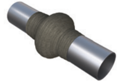
Denso Tape is applied to the joint, wrapped with a 55% overlap