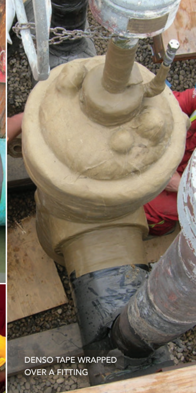
DENSO TAPE WRAPPED OVER A FITTING