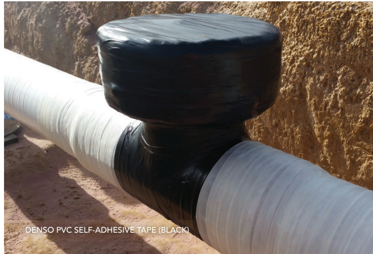
DENSO PVC SELF-ADHESIVE TAPE (BLACK)