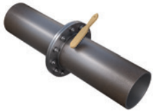
Clean joint thoroughly with wire brush