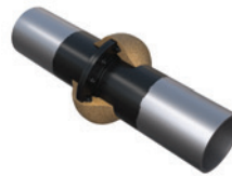
Denso Profiling Mastic is applied to the joint