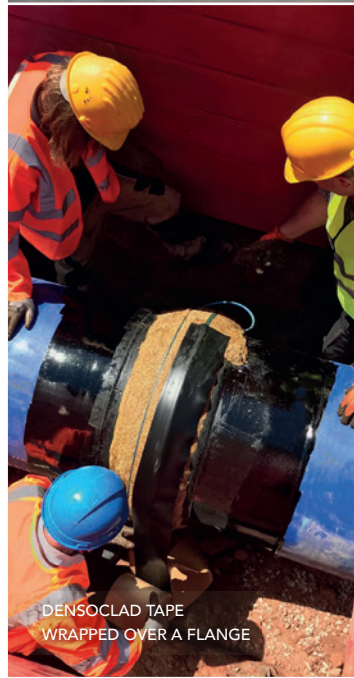
DENSOCCLAD TAPE WRAPPED OVER A FLANGE