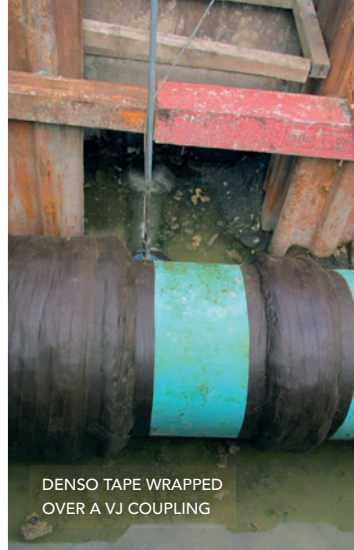
DENSO TAPE WRAPPED OVER A VJ COUPLING