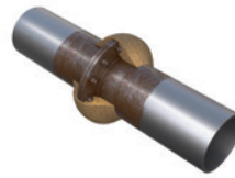
Denso Profiling Mastic is applied to the joint