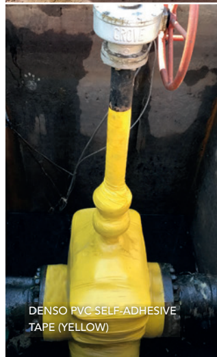
DENSO PVC SELF-ADHESIVE TAPE (YELLOW)