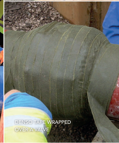
DENSO TAPE WRAPPED OVER A VALVE