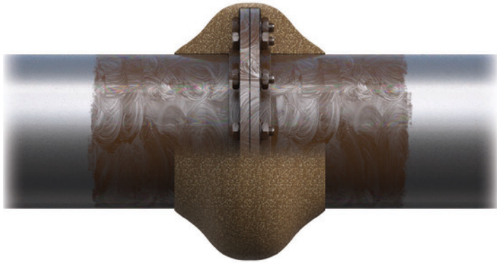
Section of pipe with Denso Profiling Mastic applied