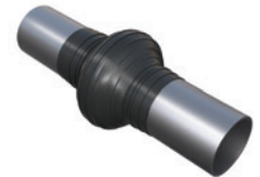
Densoclad Tape is applied to the joint, wrapped with a 55% overlap