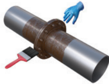
Apply Denso Paste to joint with brush - or gloved hand. Protective gloves must be worn