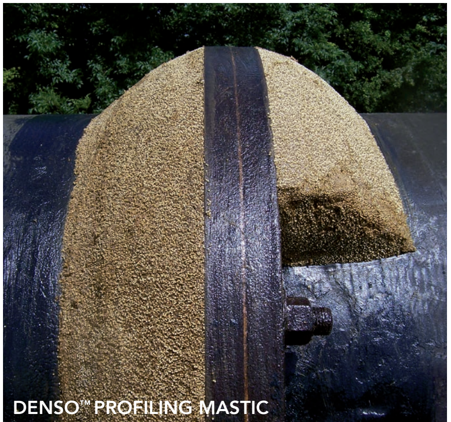
DENSO™ PROFILING MASTIC